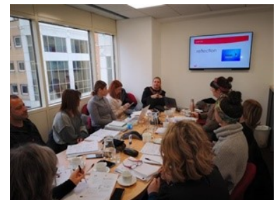
Third Transnational Meeting in London

for pupils were presented to the consortium. Both of them were developed by MMC as templates with the input of DIMITRA. The two different types of assessment tools were outputs of the workshop process that took place in Graz, Austria.